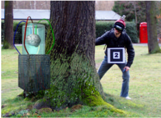
Figure 2: Outdoor player searching for virtual game items.

Our major goal of this project was to develop a collaborative game that integrates players with different user interfaces. A challenge was to design the game in a way to be as interesting and enthralling for the indoor player as for the outdoor player. We have tried to enable this feature with a strong connection and dependence between both players of one team. Neither the indoor nor the outdoor player may win the game all alone. The indoor player needs the outdoor player to collect items and the outdoor player needs the indoor player to get information about hidden game items. Other technical goals of this project were to gain experience in how to handle incomplete WLAN coverage and the accuracy of low-cost GPS receivers.