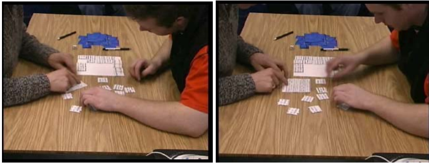
Figure 3: Two variant uses of orientation: The left image shows a partial rotation and the accompanying head gesture on the part of the recipient. The right image shows one person fully rotating an item, aligning it specifically for the other person

Personal rotation of an object that is being held was very frequent and at times seemed almost continuous. Use of variant gestural orientation seemed to generally enhance cooperation. It would appear that orienting objects towards the current user would be important in allowing a user to establish their personal space. However, automatically orienting all objects, even if they are ‘correct’ for each user may interfere with natural uses of changes in orientation in gesturing to collaborators.