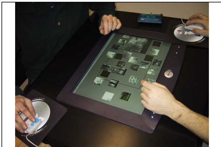
Figure 1: two people making a photographic image puzzle on the e-Table

conducted an observational study. Pairs of participants were asked to make several puzzles: two on a physical table, two on an electronic table-display, the e-Table, and two on an upright display. In each condition one of the puzzles contained oriented information such as text and the other was composed of non-oriented information such as geometric shapes. To enable collaboration in both of the electronic conditions, each participant had their own mouse (Figure 1). The participants worked on the puzzles together without interference and the entire session was videotaped. There have been eight of these sessions, six of which have been videotaped. The issues discussed in this paper come from initial observations of this video data.